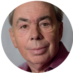
Andrew Lloyd Webber President

“This ambitious capital project comes at a pivotal moment for ArtsEd as it celebrates 100 years of nurturing young talent. The School is a leading contributor to the UK’s creative industries, internationally renowned for providing outstanding and contemporary training in the performing arts. Andrew Lloyd Webber Foundation has been a long-term supporter of ArtsEd, including providing financial scholarships for talented young people from diverse backgrounds who have gone on to successful careers in the industry. I am immensely proud to be the founding supporter of Shaping the Future, a project that will ensure ArtsEd remains a centre of excellence for many years to come.”