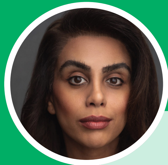
Haina Al Saud